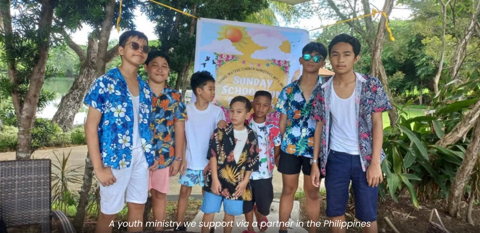
A youth ministry we support via a partner in the Philippines