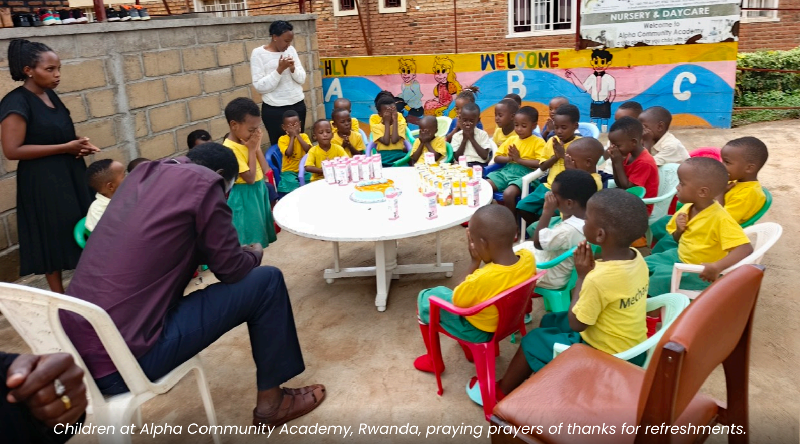
Children at Alpha Community Academy, Rwanda, praying prayers of thanks for refreshments.