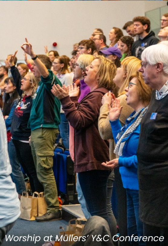
Worship at Müllers' Y&C Conference