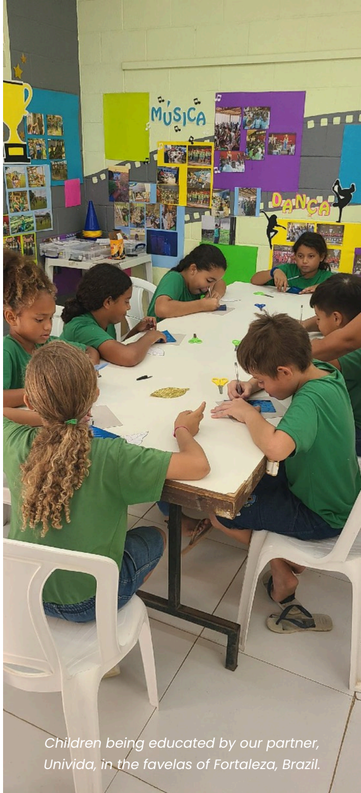
Children being educated by our partner, Univida, in the favelas of Fortaleza, Brazil.