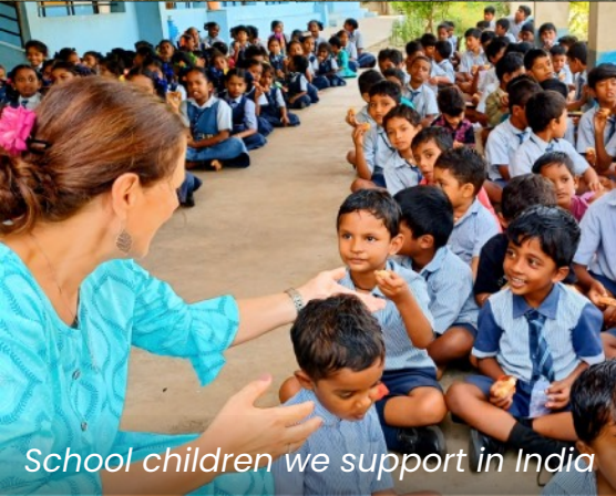
School children we support in India