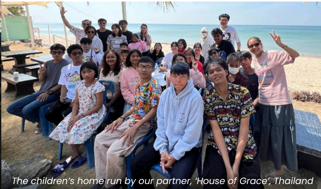
The children's home run by our partner, 'House of Grace', Thailand