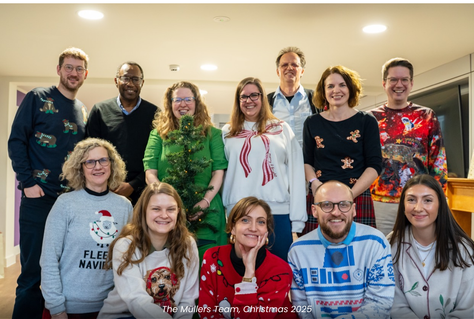
The Müllers Team, Christmas 2025

Interviews are expected to be held in person on Friday 13 February at our offices. We reserve the right to close applications earlier than the stated deadline should we receive enough potential candidates. The successful applicant will be offered the role on condition of satisfactory references and DBS check.