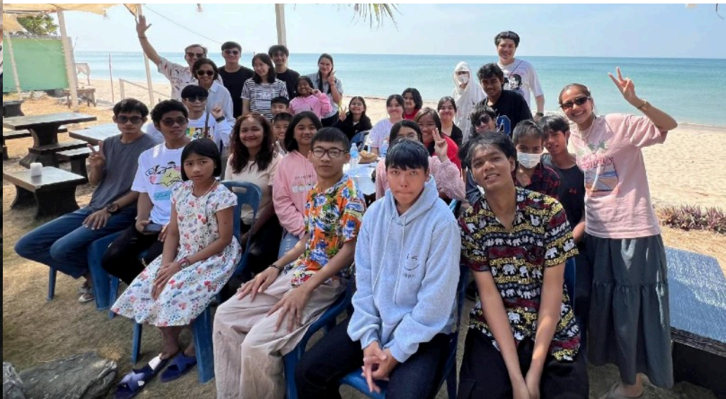
The children's home run by our partner, 'House of Grace', Thailand