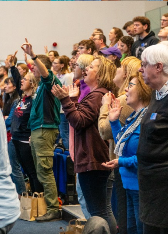
Worship at Müllers' Y&C Conference