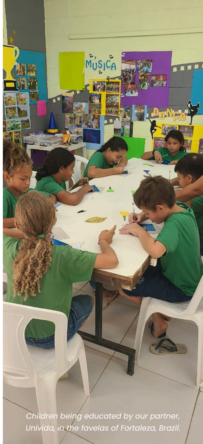
Children being educated by our partner, Univida, in the favelas of Fortaleza, Brazil.