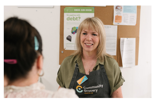
Sharing Jesus in word and deed