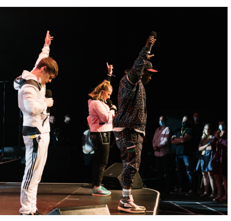
Mission teams performing gospel-centred evangelism