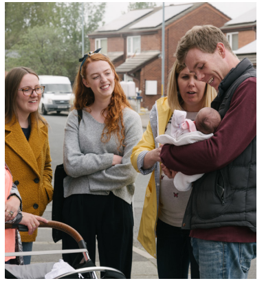
Eden teams living out being Jesus hands and feet